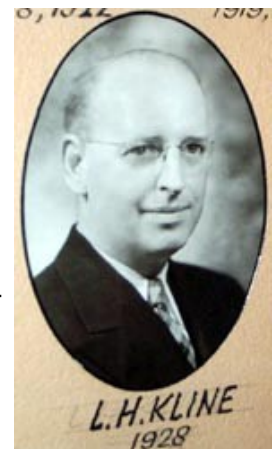
Kroehler Mfg. Co. Cost Consultant 43 years

He died September 15, 2000 in Naperville, DuPage County, Illinois and was buried in the Naperville Cemetery.